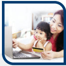
IRIS Payment Card Solution