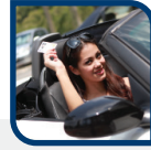
IRIS Driver's License & Vehicle Registration Solution