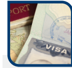
IRIS eVisa Solution