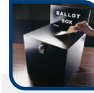
IRIS Voter's Card Solution