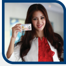
IRIS eID and Digital IDentity Solution

We offer comprehensive, highly adaptive and customisable Trusted Identification software solutions that are built on a secure and technologically advanced platform. Our solutions unify security, inventory, workflow and lifecycle requirements while managing enrolment, production, issuance of physical or electronic documents such as identity cards, ePassports, driver's licenses, voter's cards, visas and many more.