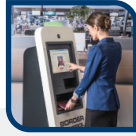
IRIS Border Control Solution