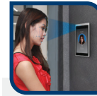
IRIS Facial Recognition Access Control Solution