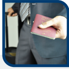
IRIS ePassport Solution