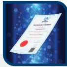
IRIS Secure Document Solution