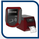
IRIS Automated Fare Collection Solution