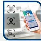
IRIS Attendance Management Solution