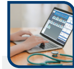
IRIS Clinical Information System