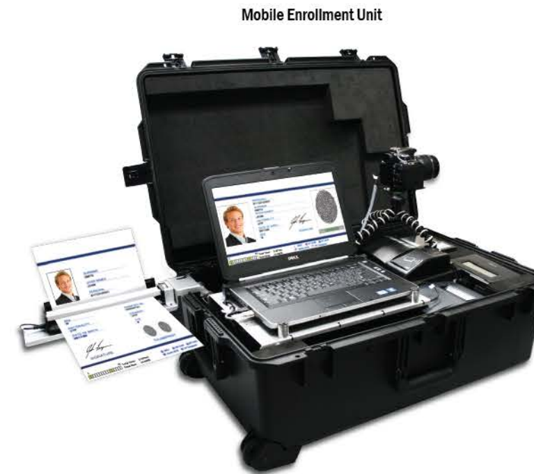
Mobile Enrollment Unit