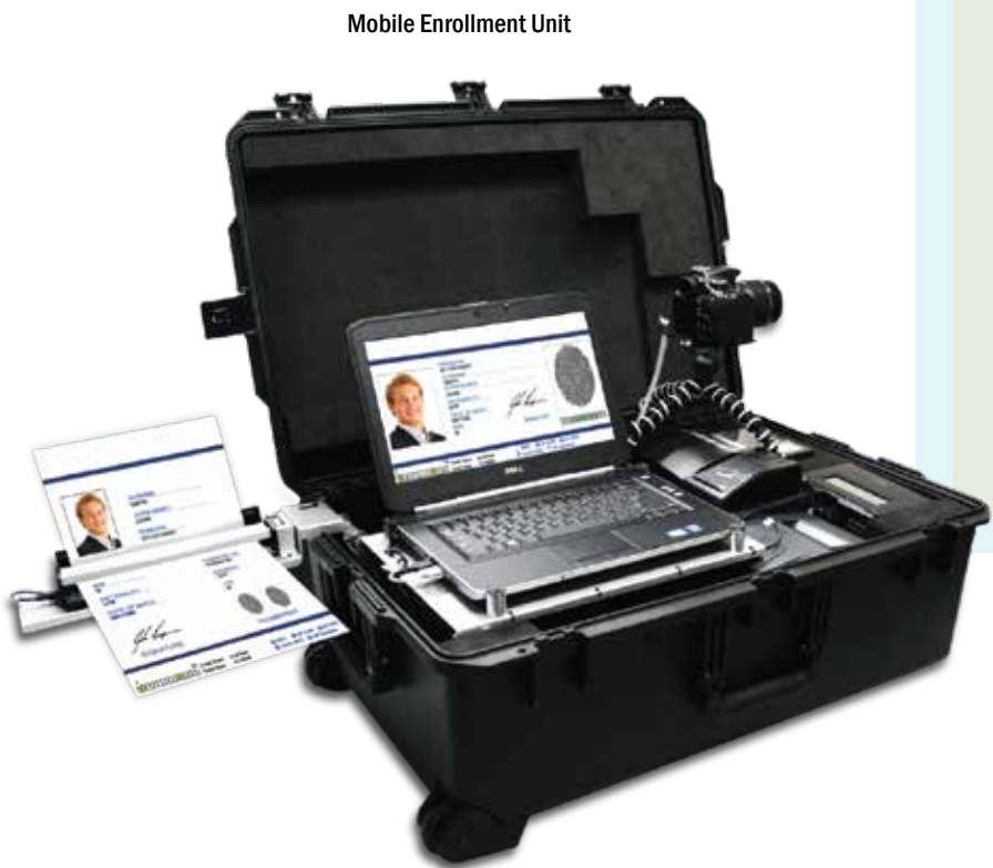
Mobile Enrollment Unit

We enjoy a strong reputation internationally for our innovative approach to electronic identification and smart card solutions. We recognise that each client has different needs and our team is committed to understanding the particular requirements of our wide base of clients before exploring possible solutions that best meet these. Every project undertaken is given utmost priority, and we apply global best practices in every instance, adapting these to local circumstances.