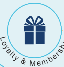
Loyalty & Membership