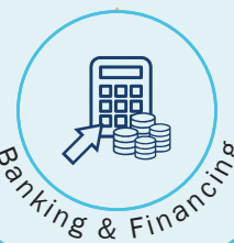
Banking & Financing