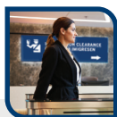
IRIS Border Control Solution