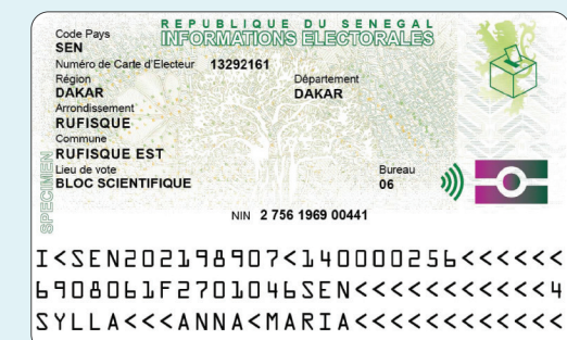
Back of the card: the card bearer's electoral information (geographical data, poll area, electoral number)