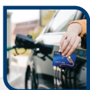
IRIS Smart Card Solution