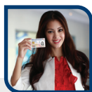
IRIS eID and Digital Identity Solution

We offer comprehensive, sustainable, highly adaptive, and customisable Trusted Identification software and solutions that are built on secure platforms and architecture. Our proven solutions unify security, inventory, workflow, and lifecycle requirements while managing enrolment, production, issuance of physical, electronic and digital documents such as identity cards, ePassports, driver's licenses, voter cards, travel visas and many more.