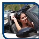
IRIS Driver's License & Vehicle Registration Solution