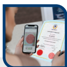
IRIS Secure Document Solution