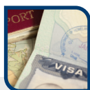
IRIS eVisa Solution