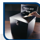
IRIS Voter ID & Management Solution