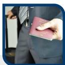
IRIS ePassport Solution