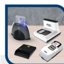
IRIS Smart Devices