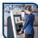
IRIS Smart Kiosks