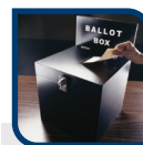
IRIS Voter ID & Management Solution