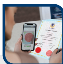
IRIS Secure Document Solution