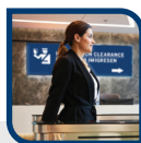
IRIS Border Control Solution