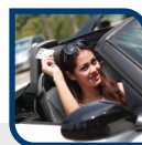
IRIS Driver's License & Vehicle Registration Solution