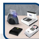
IRIS Smart Devices