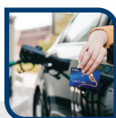
IRIS Smart Card Solution